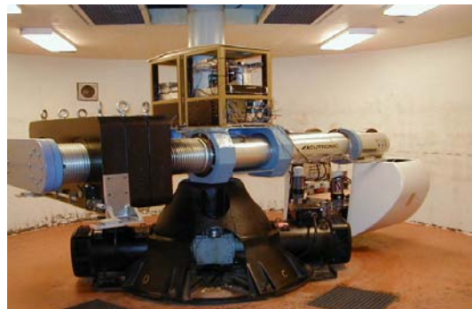
Fig. 1. RPI 150 g-ton geotechnical centrifuge

Small-scale erosion on earthen embankments is being studied, modeled and simulated, with respect to the formation of rills and gullies. Validation of the simulations was one of the primary goals of this research. Therefore scaled-down model levees are used to perform erosion experiments at 1-g and at higher levels of g in a geotechnical centrifuge. The results of experiments to date are presented in the following sections. Different water flows were used and complex geometries and boundary conditions utilized to quantitatively assess the effects of differing conditions. The physical models serve as the basis for developing accurate, digital simulations of the embankment erosion processes. The erosion processes described in this paper refer to hydraulic erosion. The time elapsed from initiation of initial rill erosion began at the crest of the landside slope to the time the eroded channel reached the crest on the waterside slope ( t_{breach} ) was measured during the tests. Photographs and videos were taken before, during and after each test. In order to simulate large scale prototype levees centrifuge tests were performed at 20g's (Fig. 1).