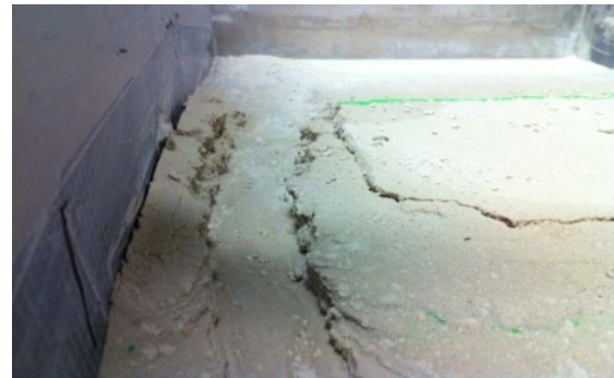
Fig. 4. Failure in centrifuge test; water flow = 0.56 lit/min, g = 20