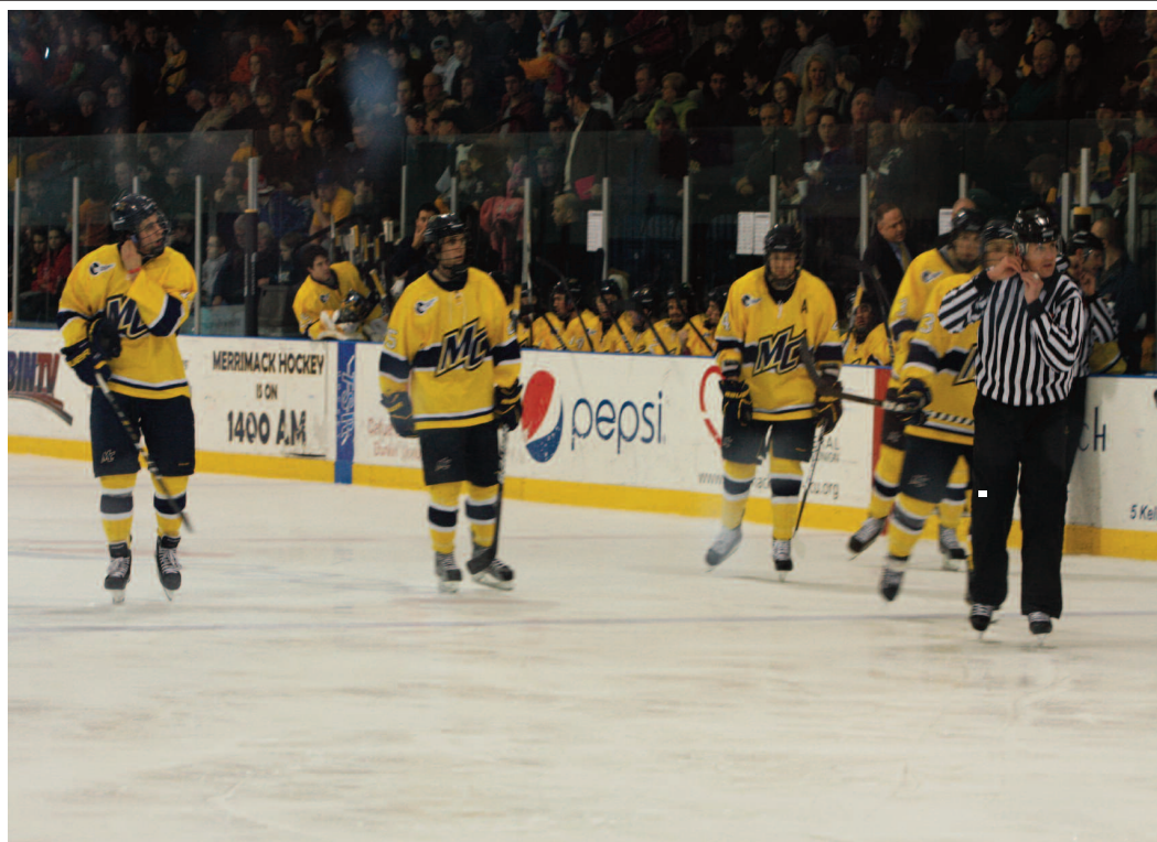
BEAST OF THE EAST: #4 Merrimack to take on #3 Boston University Friday night at Lawler Rink . See story, Page 10.