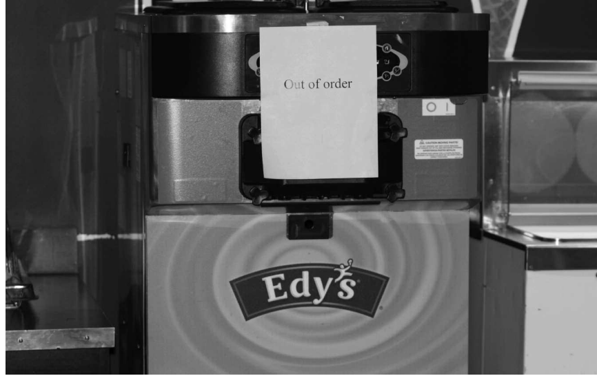
Students Scream for Ice Cream in Sparky's Place

But with the high volume use there were a few glitches with the frozen dessert machine. "We brought in a technician to calibrate it and adjust the ma-