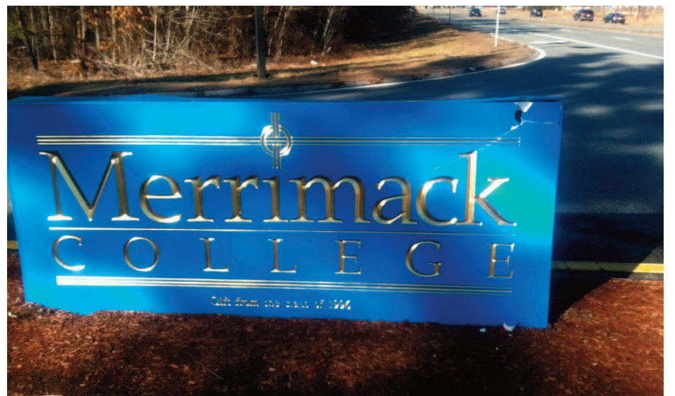
Damage was reported on Sunday January 29 to the 125 entrance sign. According to Police Services there is no information as to what caused the damage.