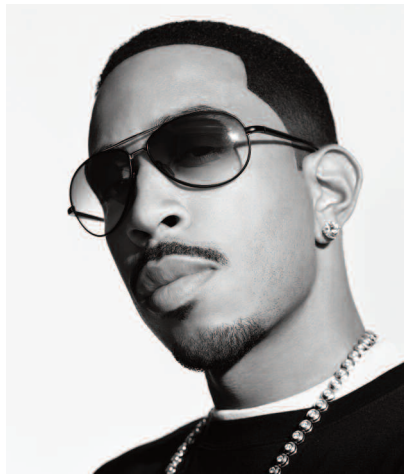
Pictured Left: 2011 Spring Concert Performer Ludacris

Tickets are $5 per student — going up to $10 on Feb. 20 — and $15 per guest (students can purchase two each). Tickets for the general public will be sold online starting Feb. 20 for $20 apiece. Cash, check or Mack Card payment is acceptable.