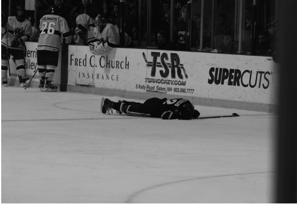
The Warriors Keep the Momentum in the Hockey East

Join the discussion at merrimacknewspaper.com . Share your thoughts and comments