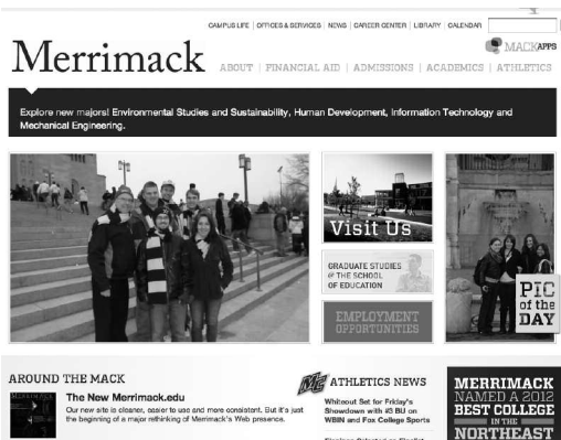
Merrimack College's New Website

system. The new Merrimack search engine returns better results and automatically suggests search topics. The new home page incorporates a simple design with more news, photos, and events happening on campus.