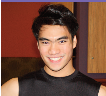
Blonde or brunette? -EK