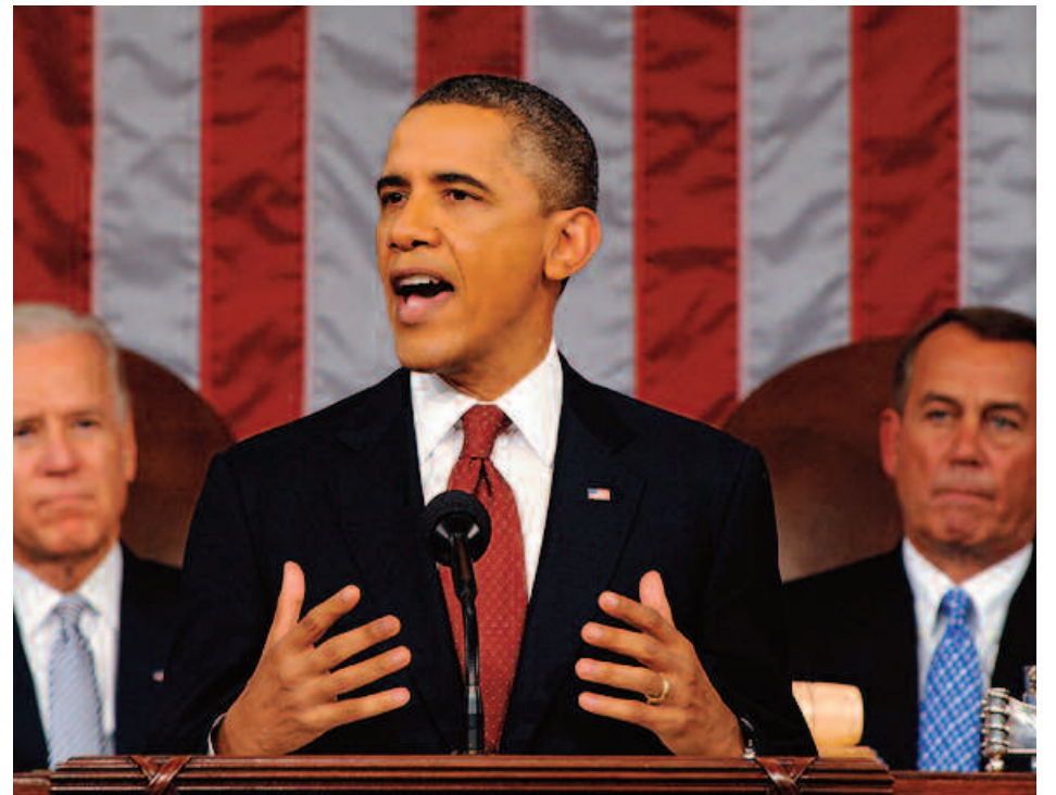
The economy and job placement was a central focus of President Obama's recent State of the Union Address.

Whether these notions come to pass the way they are expected to and whether or not Merrimack College is up to the challenge is something only time will tell.