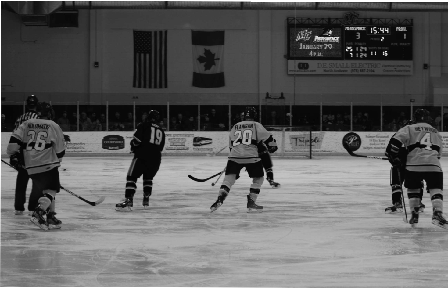
The Friars were no match for the Warriors

Join the discussion at merrimacknewspaper.com . Share your thoughts and comments