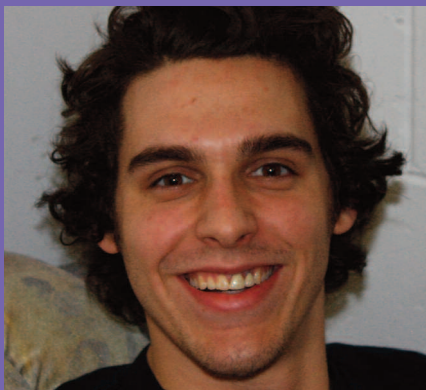
Is it wrong to be strong? -Mike Collins