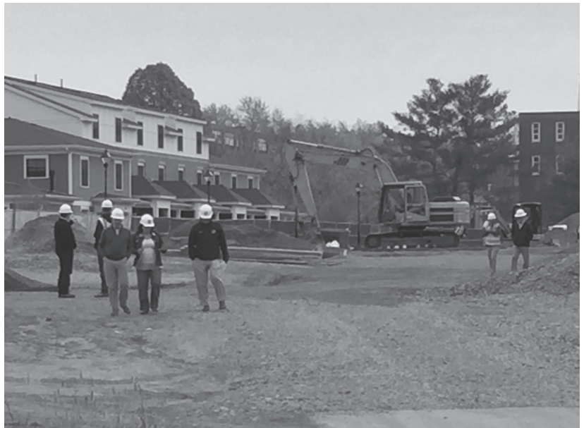
Work is progressing on the North Campus Pavilion, new home to the Girard School of Business.

Hospital in Boston. He is currently a youth service group worker for the Massachusetts Department of Youth Services.