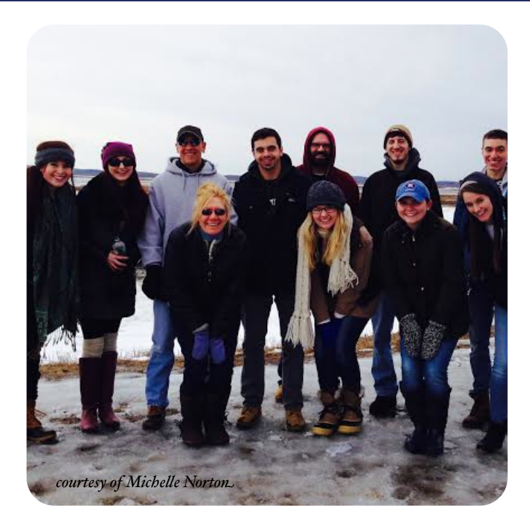
The New England Shore seminar explores the Parker River National Wildlife Refuge on Plum Island.

Interview questions composed by Alison Leonard.