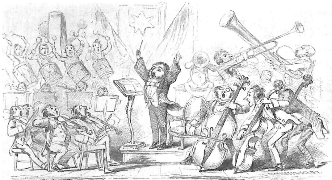
Figure 3. Jullien conducting his orchestra

The Europeans in the orchestra had performed together for years in England, and even the Americans had been playing with Jullien since September or earlier. Concerts were usually presented six nights a week, with a natural priority given to weekend nights. The orchestra was universally known for its high standard of performance. A particularly ebullient anonymous reviewer for Putnam’s Magazine commented: