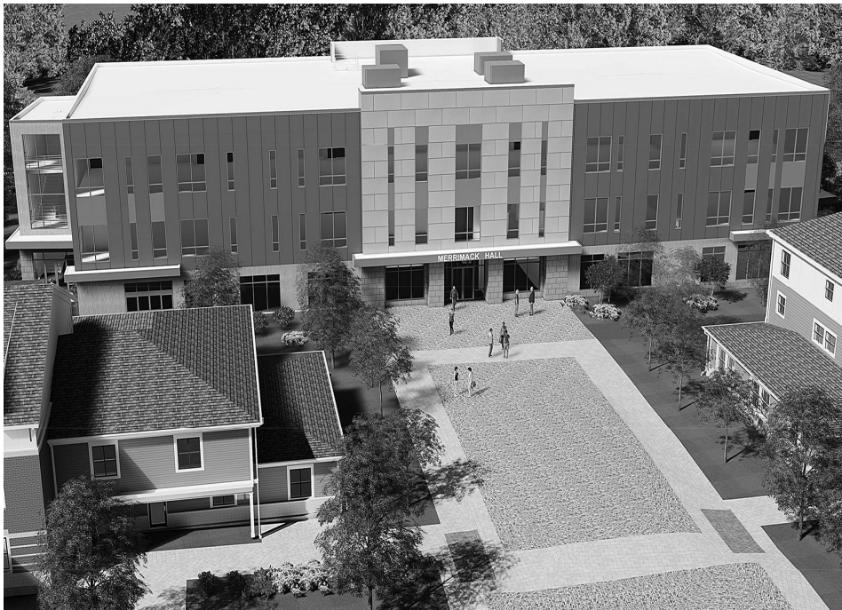
Architectural rendering of North Campus Academic Pavilion

More than 575 graduate students are also enrolled this fall, in 21 graduate programs or tracks.