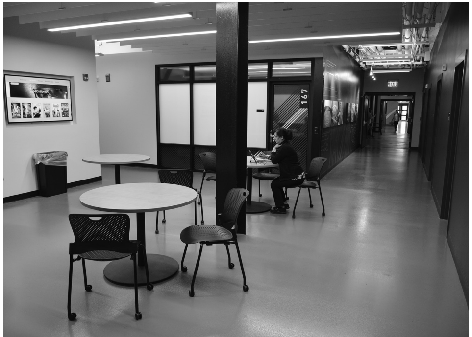
New space in Mendel’s north wing

Summer 2014 renovations at Mendel included an open-con-