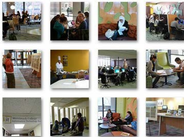
McQuade Library Merrimack College

View my 'Snapshot Day 2012' set on Flickrriver