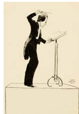
Caricature by Hans Böhrer.

Grove Music Online is a dynamic online resource and the unsurpassed authority on all aspects of music. Now available through the Oxford Music Online gateway, Grove Music Online includes the full text of The New Grove Dictionary of Music and Musicians, second edition; The New Grove Dictionary of Opera; and The New Grove Dictionary of Jazz, second edition. A subscription to Grove Music Online now also includes access to the full text of the Oxford Companion to Music and the Oxford Dictionary of Music.