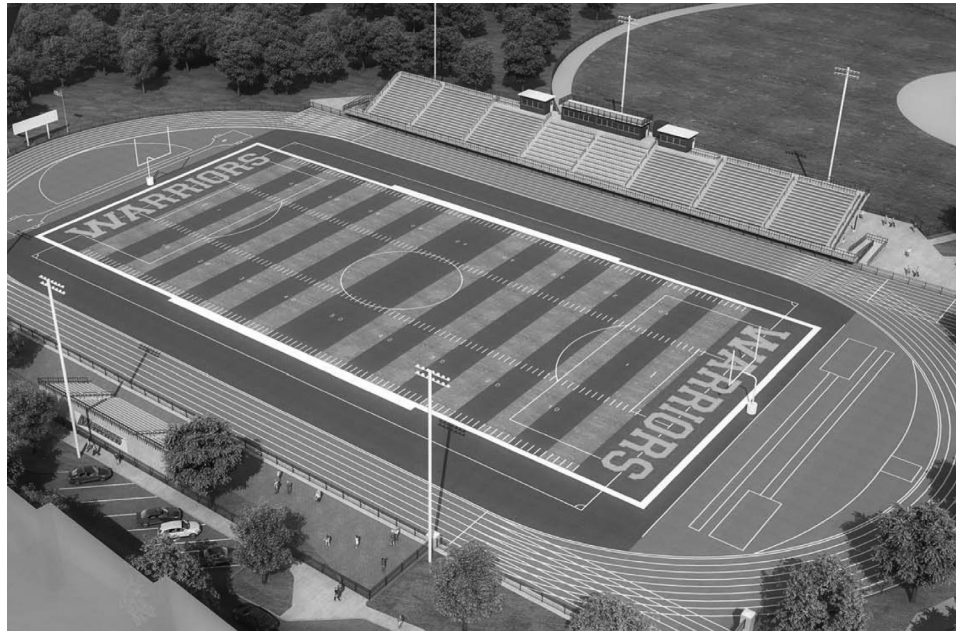
Architect's rendering of new 2,500-seat stadium and eight-lane track in the athletic district.

Hopey noted that when students return in the fall, several departments across campus will be relocated to new,