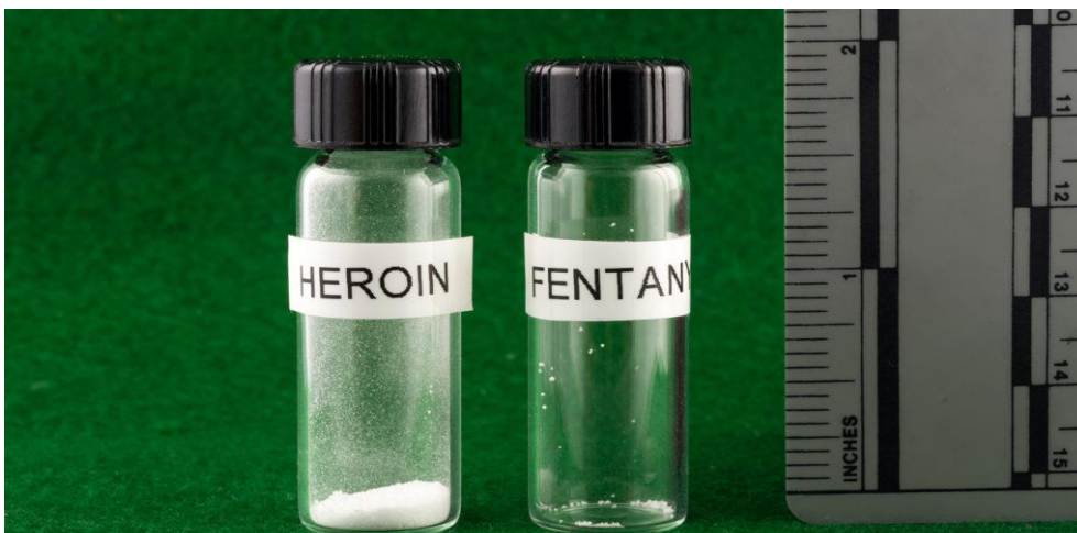
Figure 1: Fatal doses of heroin and fentanyl.

It is difficult to address the issue of dealers lacing their drugs and may prove to be a progressing issue. A drug called carfentanil, which is roughly one hundred times more potent than fentanyl, is now appearing in drugs sold on the streets. According to an article from the Huffington Post, “the drug is so powerful, a tiny 20-microgram dose — about the size of a grain of salt — can be fatal” (Lambert, 2016). Overdoses are becoming an increasing issue because users are already injecting a dangerous amount of substances through heroin, without knowing that the dose is mixed with another drug one hundred times stronger; the extent of which is evident in Figure 1 below (Bond, 2016).